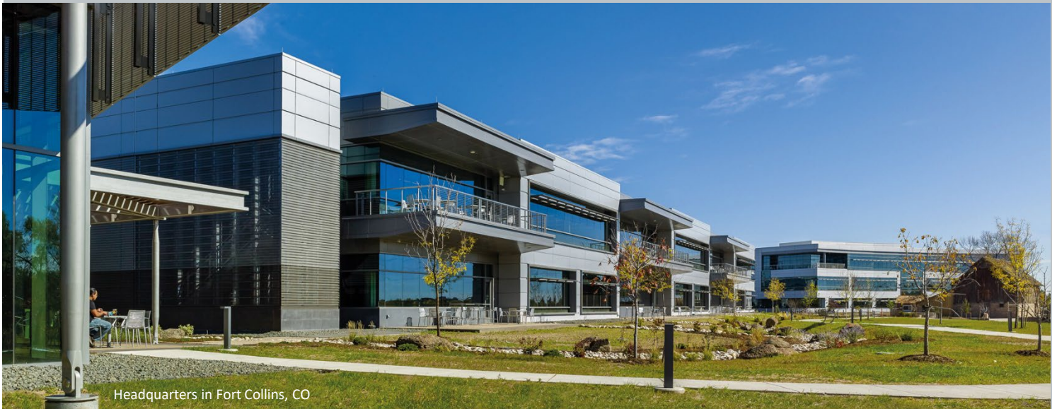
Headquarters in Fort Collins, CO