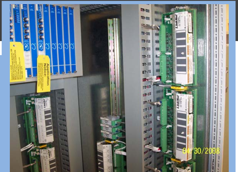
Bently Nevada/LinkNet® Cabinet