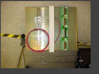
Power & Analog FTMs, Relay FTMs