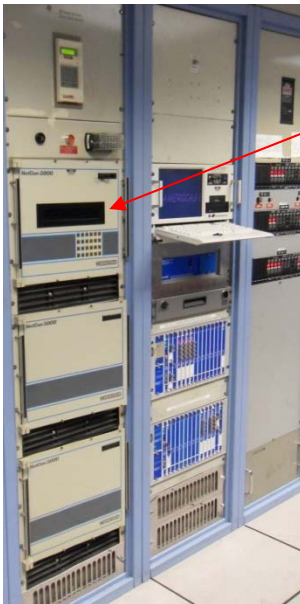
Front View—Before and after MicroNet+ Installation