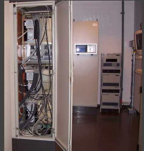
Side-by-side comparison—MicroNet Plus vs. NetCon