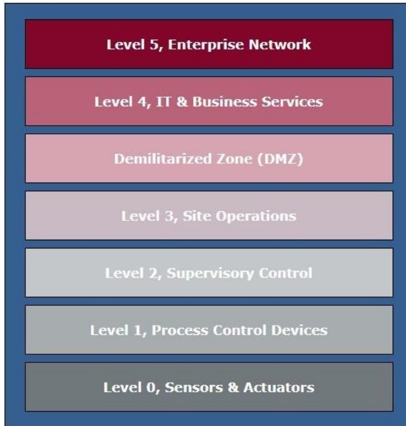
Figure 2-1. Purdue Model

The Purdue reference model illustrated above represents a typical OT network architecture. Level 5 represents the enterprise IT network with level 4 representing services provided by IT.