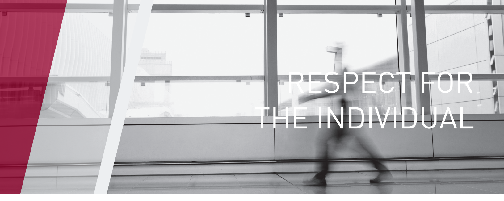
The dignity, value, and equality of all members is acknowledged and demonstrated through our actions.