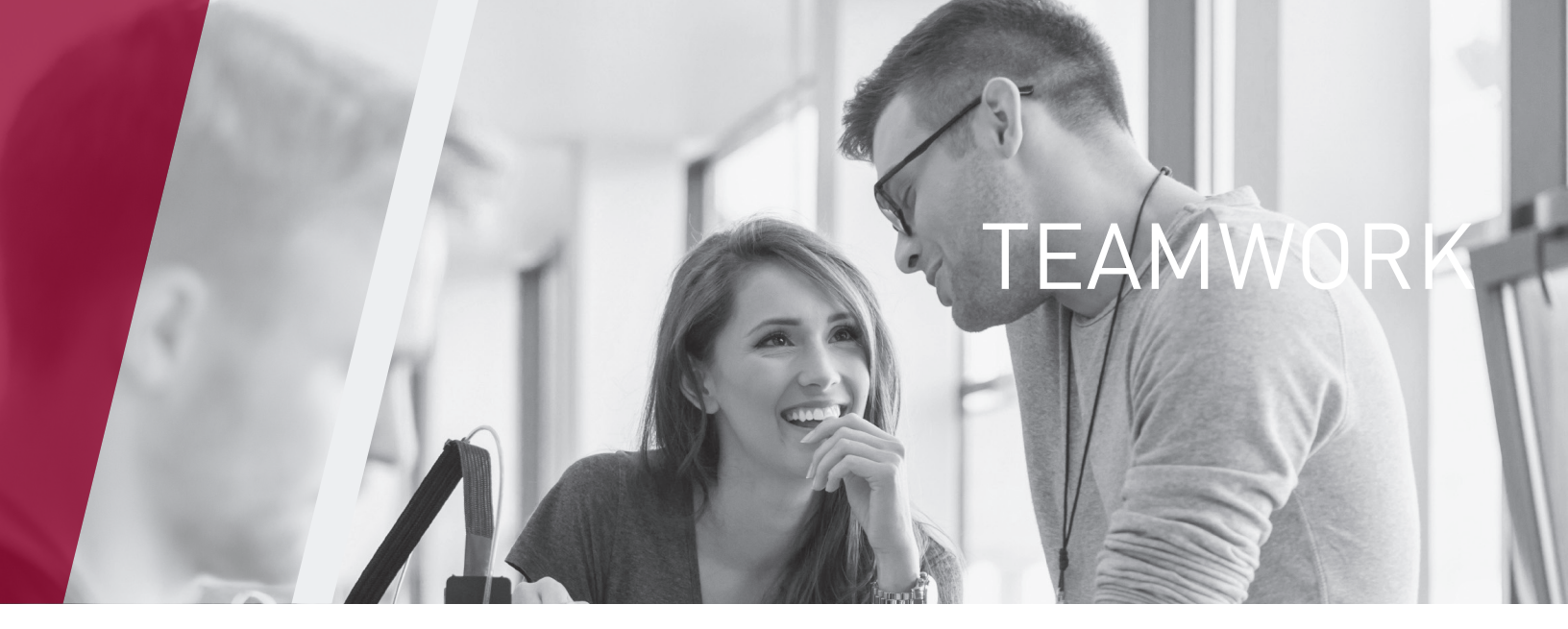
Members work collaboratively across all levels, functions and locations to build trust, leverage our capabilities, and strengthen the company. - Woodward Constitution