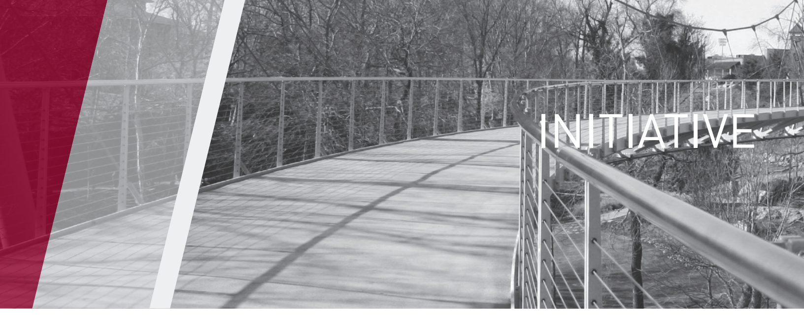
Members act with a sense of urgency to improve business results, and are committed to continuous improvement and self-development.